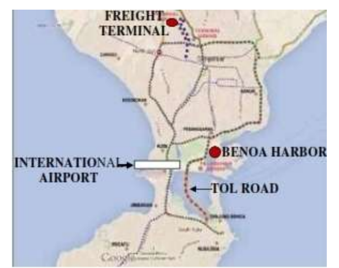
Figure 3 Fixed Facility Networks (Benoa Harbor, Ngurah Rai Airport, Freight terminal)

Skill networks; Network system expertise or skills required by both private and public, in this case the government until today has not been so intensively conducted it. As for example with regard to driver capability, standardized delivery service quality.