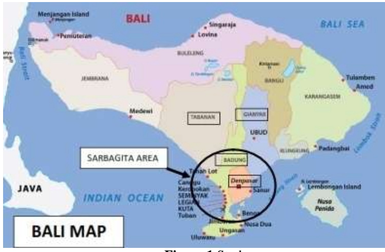
Figure 1 Study area

Unfortunately, the problem of urban freight transportation in Bali is very rarely discussed in social problems in Bali. Not much is known on how to solve the problem. The purpose of this research is to find a method to map the city based on its node and its logistics flow. Urban transport studies concentrate on the distribution of inter and intra-urban goods and vice versa (recycling and return of damaged goods) flowing in urban areas. Includes other logistics functions such as loading and unloading, consolidation, and goods terminals that function in the node between long haul transport and city distribution. This study also addresses the issue of freight transport in Bali, to provide an overview of logistic modeling patterns of nodes and flows. This study area as shown in Fig. 1