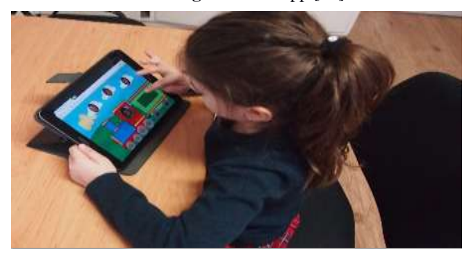
Fig.2. Autism app [16]

The study would be able to investigated the recognition of standardized facial expressions of emotion anger, fear, disgust, happiness, sadness, surprise at a perceptual level - pass a basic emotions recognition test but fail to recognize more complex stimuli involving the perception of faces or part of faces.[15]