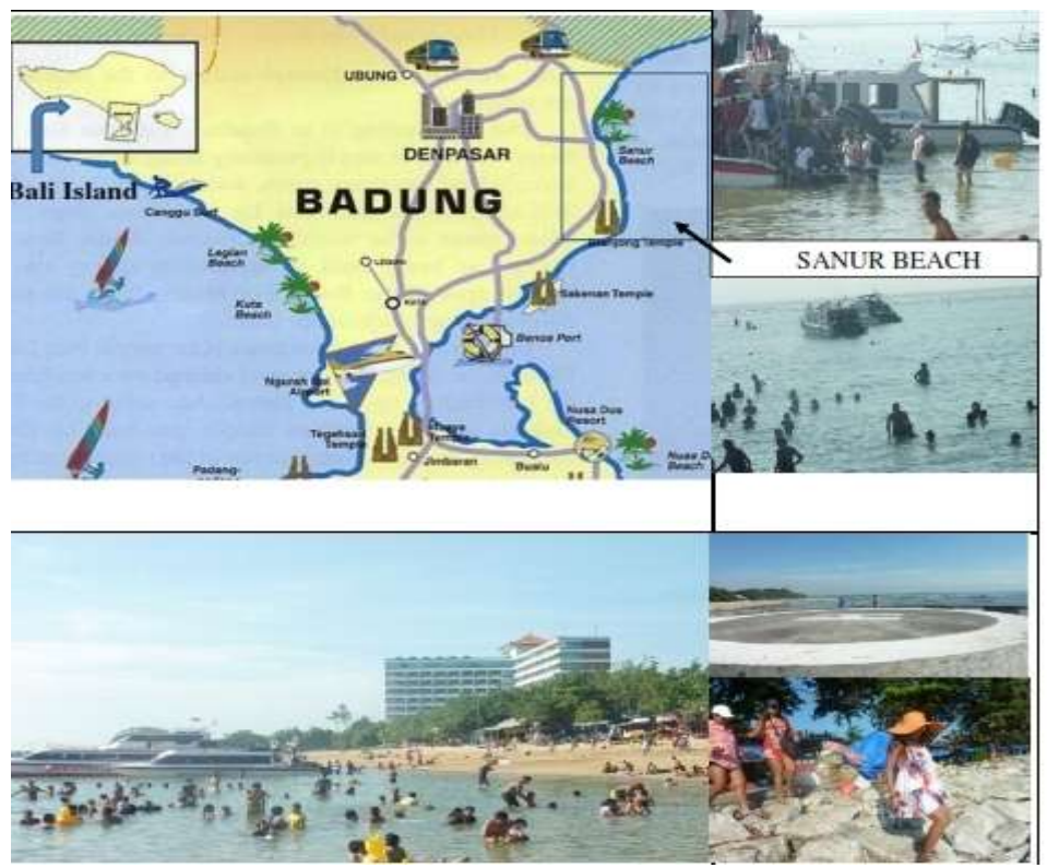
Figure 2 Sanur-Bali Port Potency